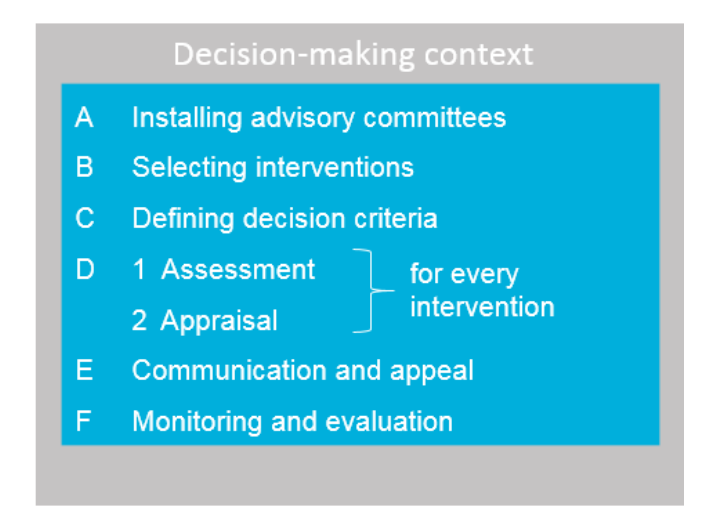
Figure 1. The Six Steps of the Evidence-Informed Deliberative Process Framework.

UHC-EPHS workshops in Islamabad, Pakistan (November 2019 and February 2020).